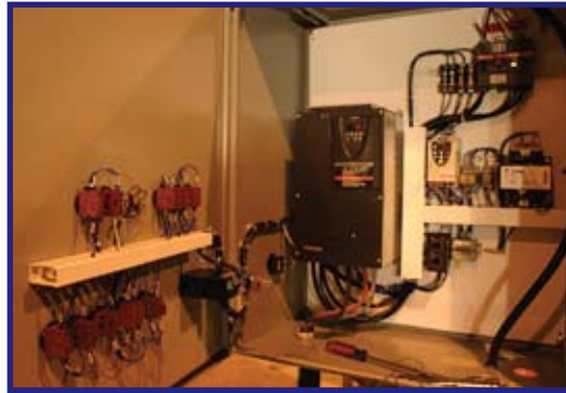
Load Sensing System